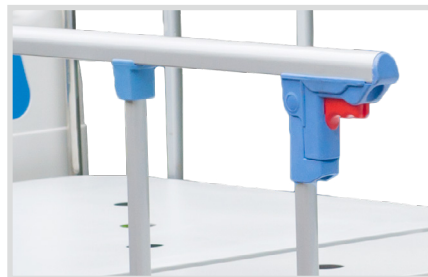
Push red button to lay down down the side rail