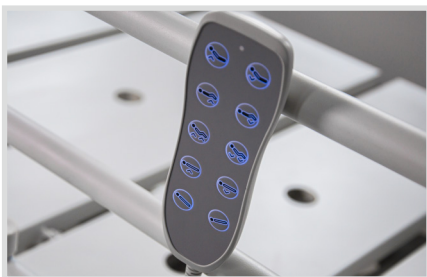
Handle with backlight